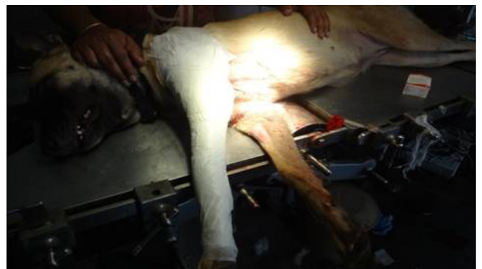
Figure 5: Full limb bandaging for immobilization of joint