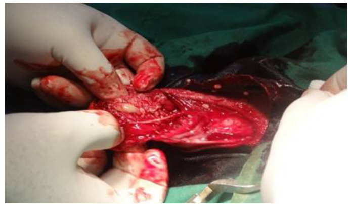
Figure 3: Appearance of bursa

Olecranon bursa was then gently separated from its soft tissue attachment by blunt dissections without rupturing it or injuring the joint capsule (Figure 3). Bleeding from major vasculature was checked by ligature with chromic catgut No. 00 whereas, the capillary bleeding was checked by manual pressure with guaze sponge. Hygroma along with