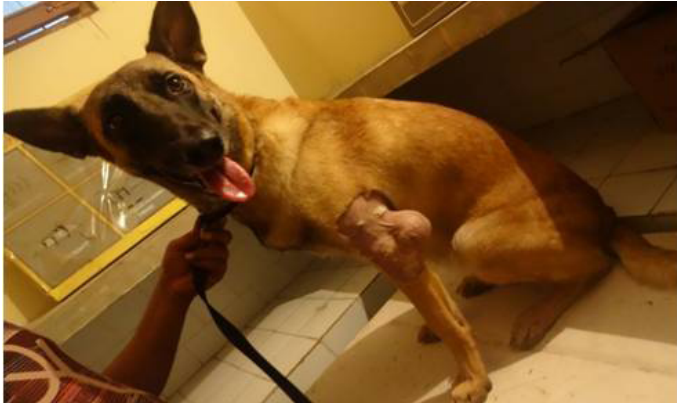
Figure 1: Appearance of olecranon bursitis on left elbow

recent trauma to the elbow. The dog was treated earlier with intralesionally administration of dexamethasone and hyaluronidase after aspiration of transparent fluid without successful outcome. Rectal temperature, heart rate and respiration rate were found to be within normal range. Keeping in view of progressive enlargement of growth which produced difficulty in walking and dog sitting posture, surgery was planned.