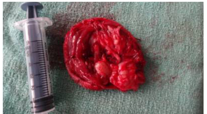
Figure 6: Removed hygroma along with bursa

skin was removed (Figure 6). The fascia and muscles were sutured with chromic catgut No. 0 and skin was sutured