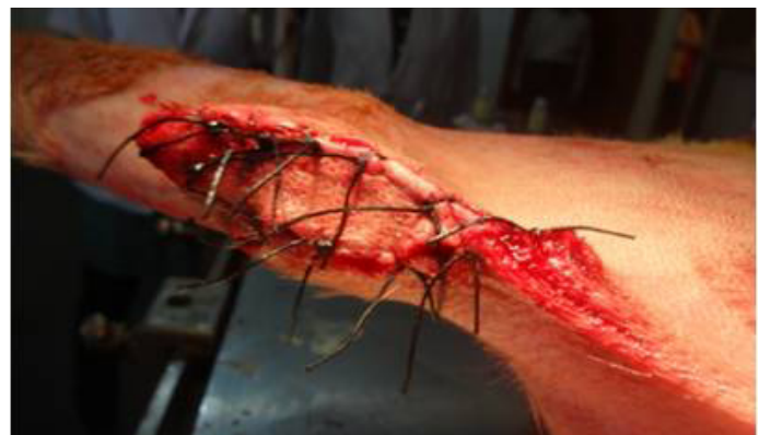
Figure 4: Operative site after completion of surgery