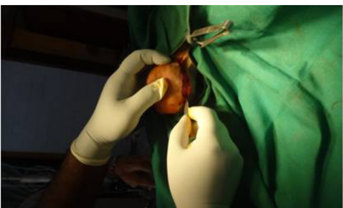
Figure 2: Elliptical incision

The site was prepared aseptically. The animal was administered with Atropine sulphate@0.04 mg/kgbw. After 5 min., xylazine hydrochloride @ 1mg/kgbw was administered as preanaesthetic. Propofol “to effect” was given after 15 min. of xylazine hydrochloride administration. Intravenous fluid therapy was initiated prior and continuous infusion rate of propofol was maintained during the period of surgical management. Animal was placed on table in lateral recumbency by keeping the left fore limb on upper side. An elliptical incision (Figure 2) was made along the posteriolateral aspects of the point of elbow and over the growth area.